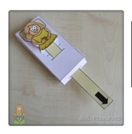
9. Slide the long tab through the two remaining slits.