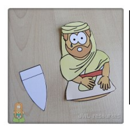
13. Jairus can be cut along with his support. Fold the support along the dotted lines.