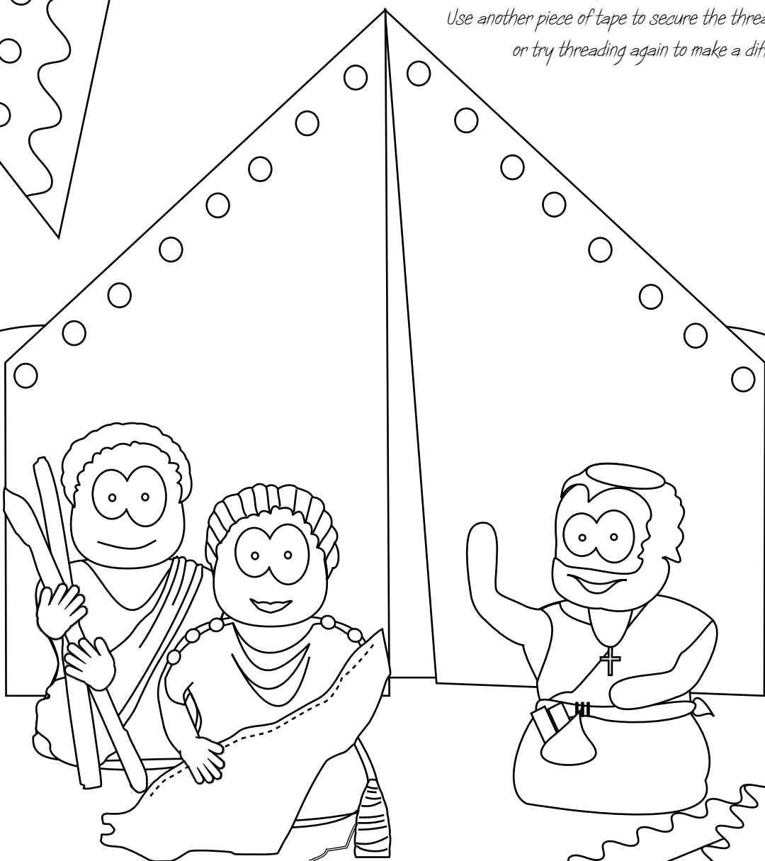
Priscilla, Aquila & Paul Tentmakers spreading the Gospel

or try threading again to make a different pattern.